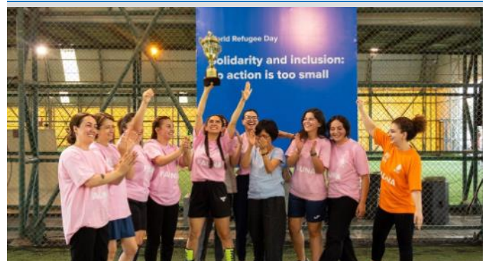
Inclusive sports event in Baku

3,263 IDPs and other vulnerable people benefitted from eye tests and free-of-charge eyeglasses by the Japanese Fuji Optical in May-June 2024.