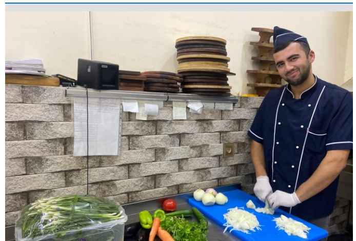
Learning the art of cooking

2,852 IDPs and other vulnerable people benefitted from eye tests and free-of-charge eyeglasses by the Japanese Fuji Optical in 2023.